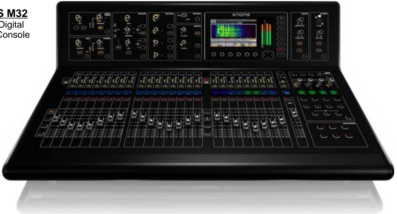
MIDAS M32 40-ch Digital Mixing Console